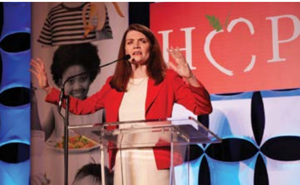
Jeanette Walls, best-selling author and keynote speaker